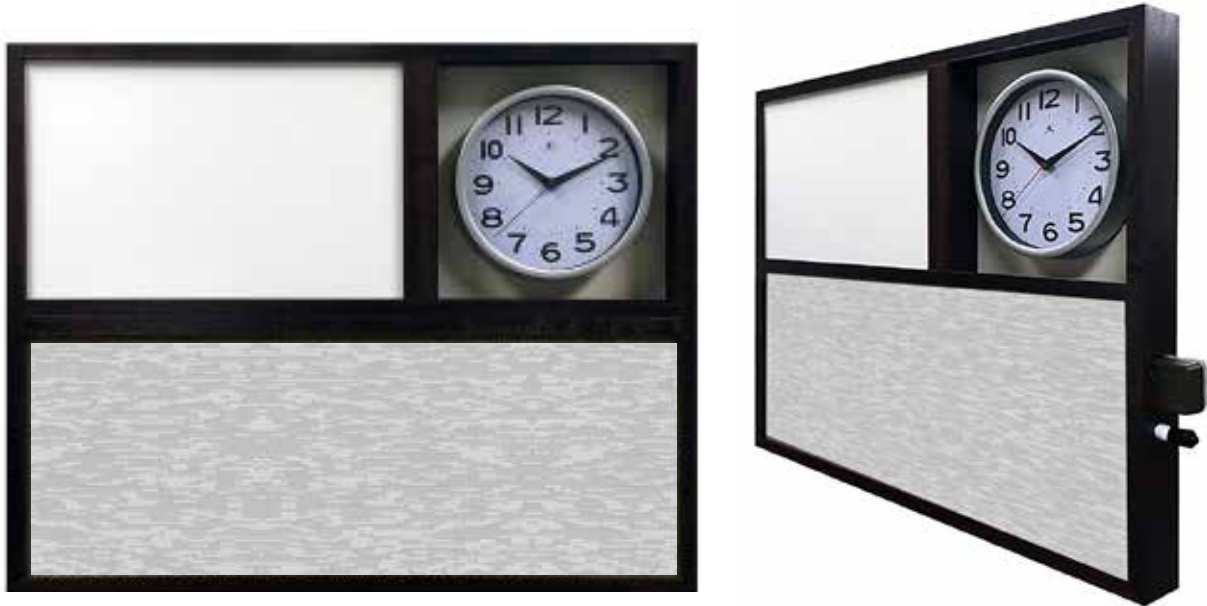
Fabric Shown: Marble

Patient Information Boards combine a large tackable surface, marker board, an internal marker-eraser compartment and an Infinity clock. This product provides all the premium features at an affordable price.