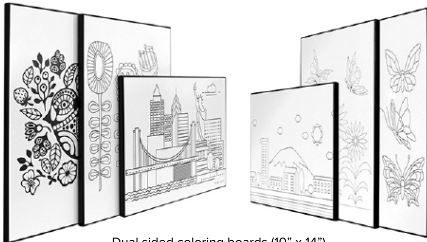
Dual sided coloring boards (10" x 14")